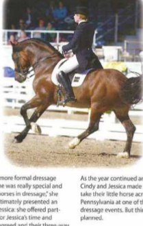
Cardi at the center during Dressage at Devon.

From there, Cardi continued to move up the levels, winning all in both. As a four year old, he competed successfully in the way First Level dressage and sanctioned Welsh shows, mostly in English Pleasure. At five, he was the USDF Region 6 Second Level Champion with a score of 69% and Northwest Reserve Champion with a score of 70%. As a six year old, he was Third Level Champion at Donida (in Auburn, Washington), scoring 71.6%. At